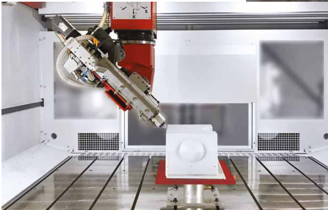
45 degree extruder orientation and printing